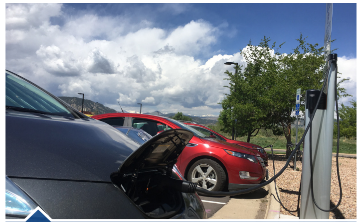
More fast charging stations are needed to encourage widespread adoption of electric vehicles.

Promote other clean modes of transportation like EV carsharing, electric buses and walking, biking and transit in order to encourage clean travel without requiring EV ownership.